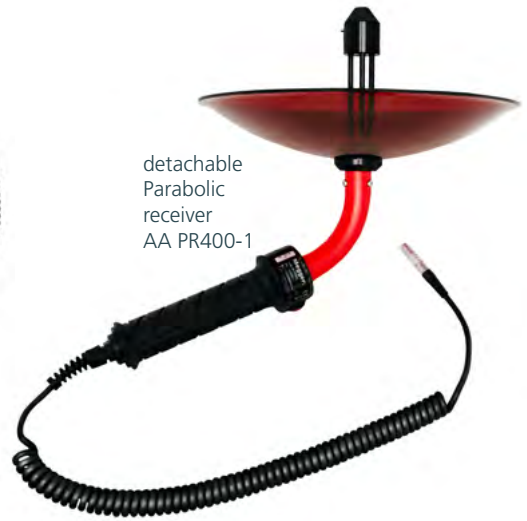
detachable Parabolic receiver AA PR400-1