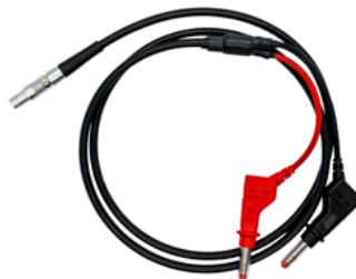
VK 155 LRHR cable