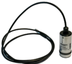
Acoustic-contact probe ACP30-1