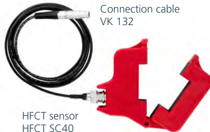
Connection cable VK 132 HFCT sensor HFCT SC40